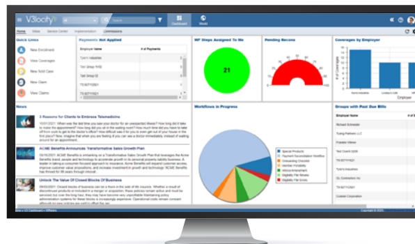
V3locity CoreAdmin Dashboard

V3locity for insurance administration leverages the powerful enterprise features of V3locity, whose