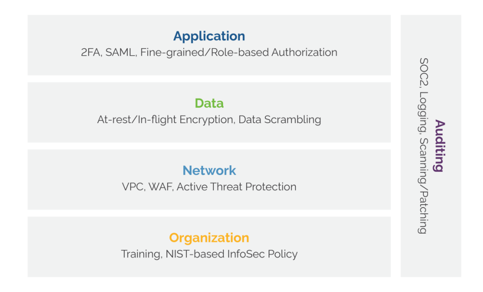
Figure 3: V3locity Managed Services' Organizational Practices

As an organization that provides software to process sensitive data including PII (Personally Identifiable Information) and PHI (Personal Health Information), Vitech has developed our software and instituted practices (see Figure 3: V3locity Managed Services' Organizational Practices) based on industry-standard security and data privacy constructs. V3locity Managed Services includes two fundamental security concepts: users and roles. V3locity supports role-based security for users. Authorization can be configured for any V3locity asset (forms, documents, portals, menus, fields) either at the role level or the user level. V3locity offers native identity management and authentication, including multi-factor authentication. V3locity data is encrypted in transit and at rest. The AWS key management service (KMS) is used to create and manage cryptographic keys while AWS Secrets Manager is used to rotate, retrieve, and manage the secrets, such as log-In credentials, needed to access the V3locity Managed Services.